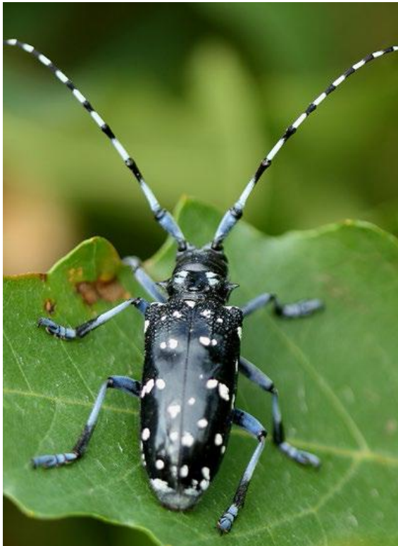
Asian longhorned beetle Anoplophora glabripennis (Motschulsky)